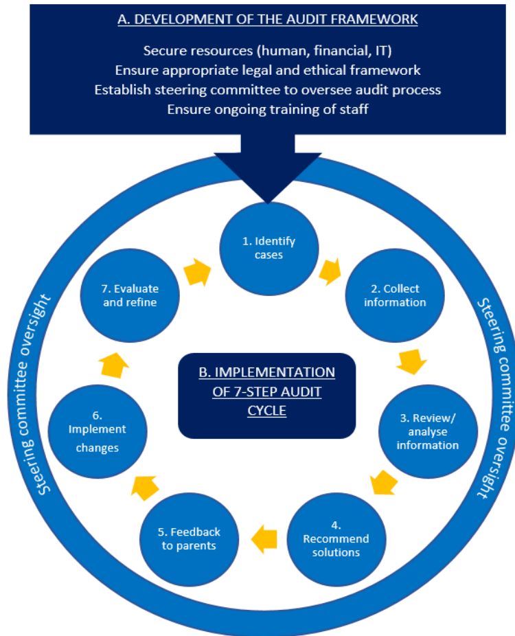
Figure 1 Steps in the perinatal mortality audit cycle